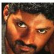
Kalyan Ram under Teja's direction Galatta